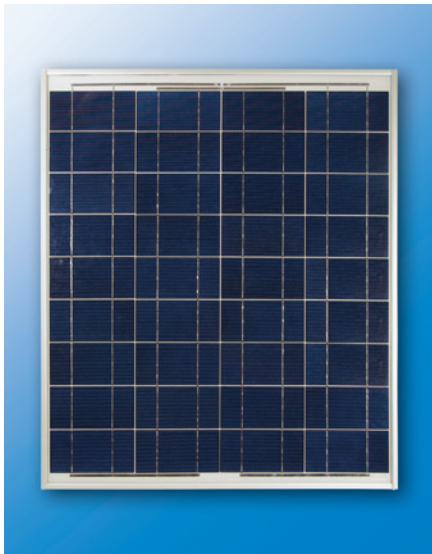
The SunWize SW-S65P solar module