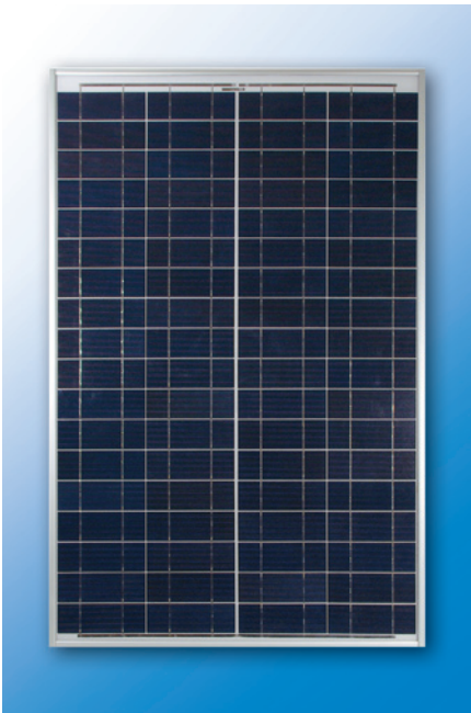
The SunWize SW-S85P solar module

The SunWize SW-S85P solar module delivers top-quality performance for all photovoltaic applications including telemetry, communications, security, rural electrification, water pumping and general battery charging. The SW-S85P can be used in single-module and multiple-module installations. Each module consists of two 36-cell series strings providing sufficient voltage for battery charging under extreme high temperatures. The modules are manufactured according to the strict requirements of international and US quality standards. 25-year limited warranty.